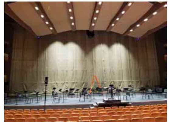
CENTER IN THE SQUARE - KITCHENER