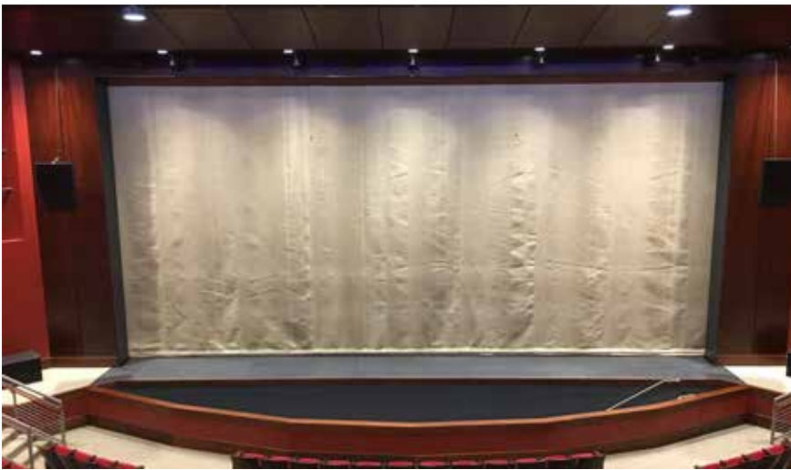
The fire curtains meet or exceed the following: